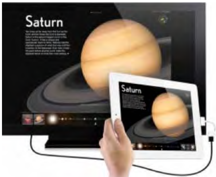
The iPad2 allows mirroring: the ability to show exactly what's on your iPad2 to display on the projector screen with the use of an adaptor.

The FIT lab has a limited number of Apple adaptors for laptop and device projection. However, we highly recommend users visit the University Bookstore to purchase an adaptor. To learn more about your device's adaptor needs, visit the FIT lab or contact Jeff Schomburg at 431-5073.